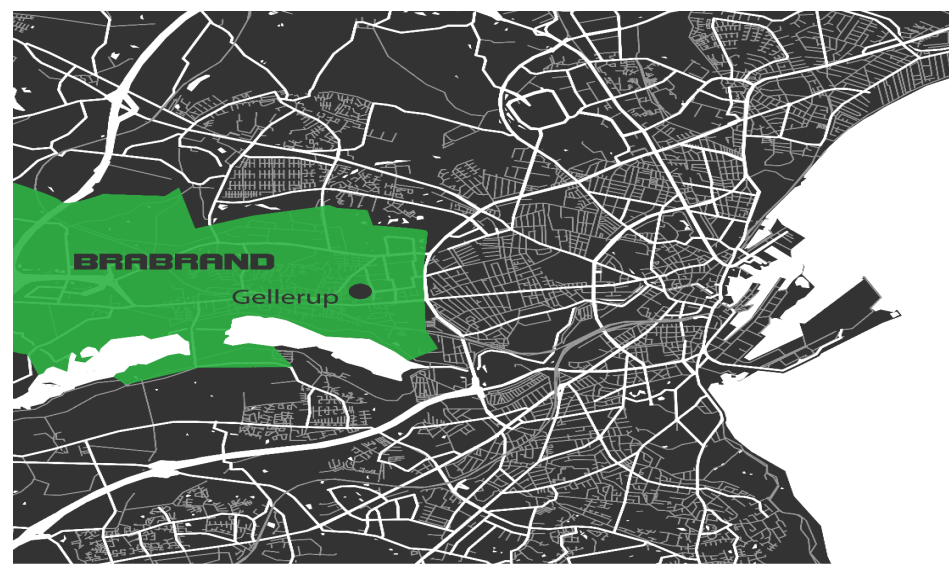
Figure 1: The Positive Energy District (PED) in BIPED

Based on these discussions and feedback led by Aarhus Kommune (AAKS), the positive energy district in BIPED was defined as the entire Brabrand area, identified by the postcode, 8220: